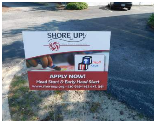
Yard signs were placed throughout the area and at all EHS and HS sites.