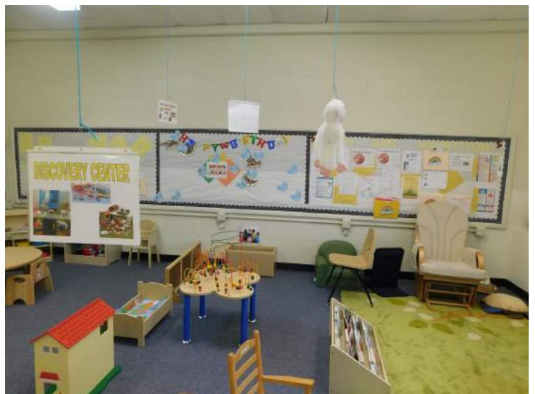
The Dorchester Early Learning Center received some needed renovations in FY20.

The average daily attendance for children in SHORE UP!'s DELIC was at 87 percent.