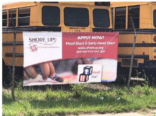
A banner hangs at the agency's garage in Wicomico County.