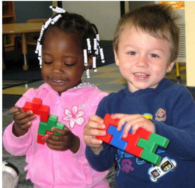
Children in SHORE UP!'s EHS program.

School readiness data indicated that 84% of HS children were meeting age expectations in the Social and Emotional Development Domain.