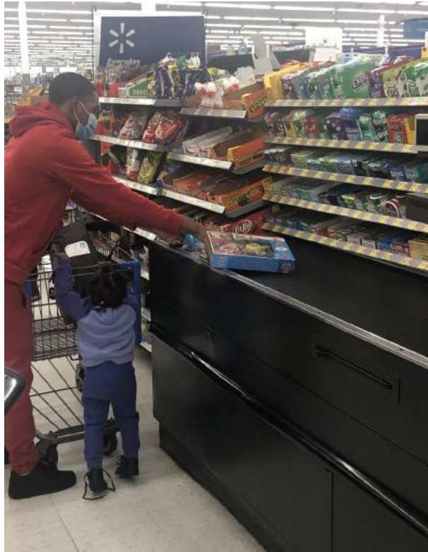
In conjunction with community partners, SHORE UP! provides an opportunity annually for parents to shop for their children and obtain financial tips.