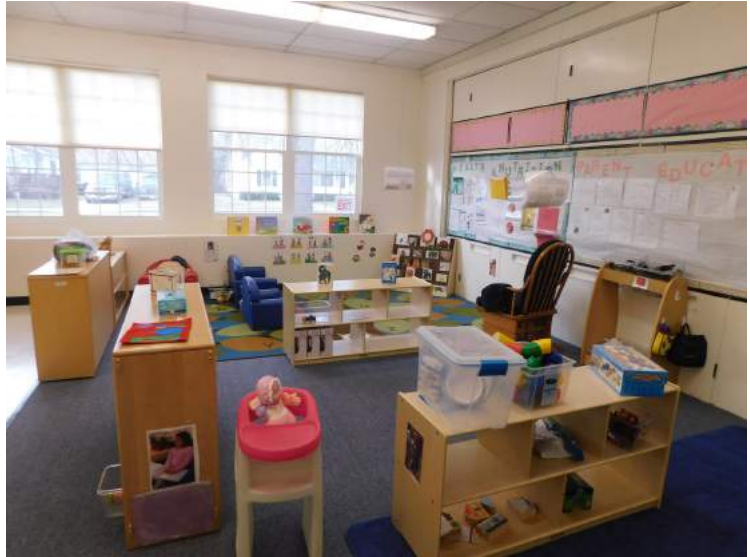
Classrooms in the Dorchester Early Learning Center.

The average daily attendance for SHORE UP!'s EHS program stood at 80 percent for FY20.